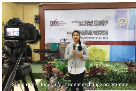
Student at Indonesia for student exchange programme