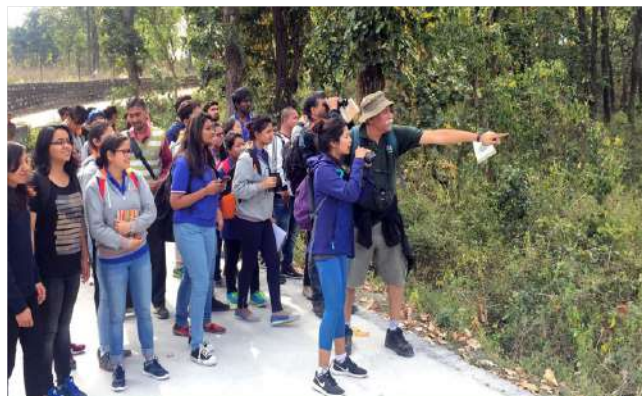
Students at Rajaji National Park