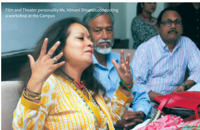
Film and Theater personality Ms. Himani Shivpuri conducting a workshop at the Campus