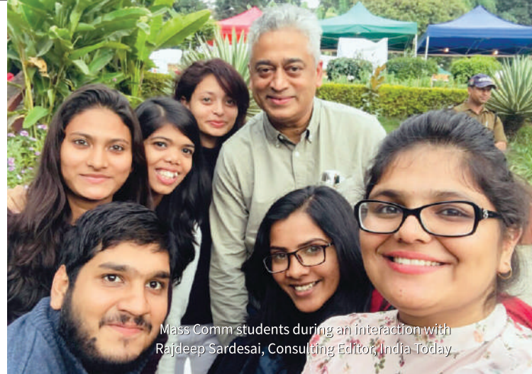
Mass Comm students during an interaction with Rajdeep Sardesai, Consulting Editor, India Today

Set in Dehradun, a growing hub for creativity and communication, students benefit from a vibrant, affordable, and supportive ecosystem for learning and living.