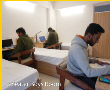
3 Seater Boys Room

The mess provides hygienic and nutritious food to the students. The students decide the weekly menu according to which meals are prepared and served. Mess staff is conscious about the cleanliness and quality of food in a hygienic manner.