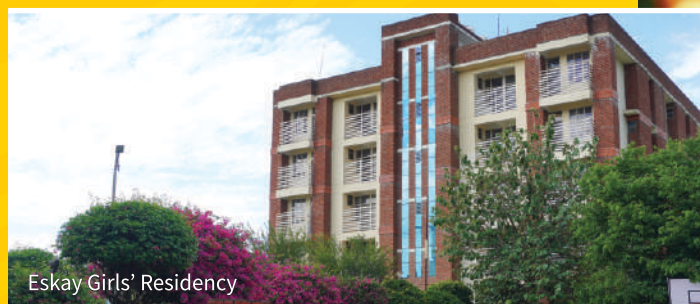
Eskay Girls' Residency