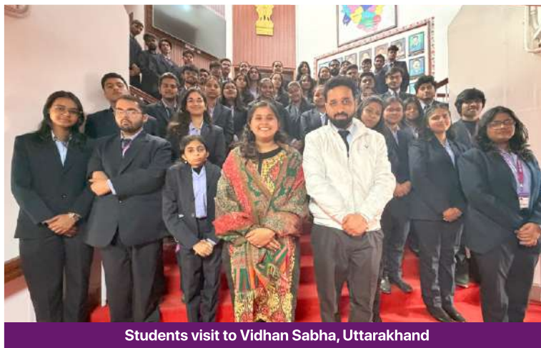
Students visit to Vidhan Sabha, Uttarakhand