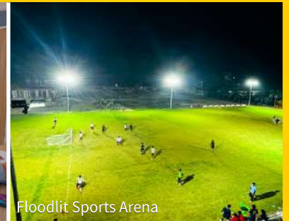
Floodlit Sports Arena