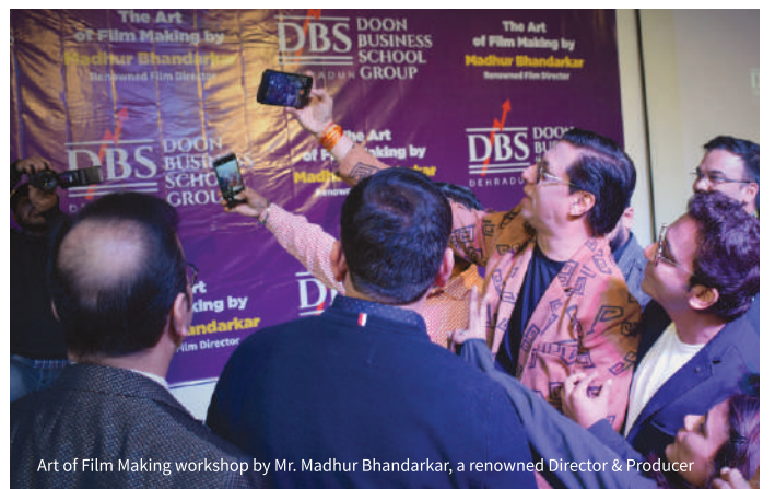
Art of Film Making workshop by Mr. Madhur Bhandarkar, a renowned Director & Producer