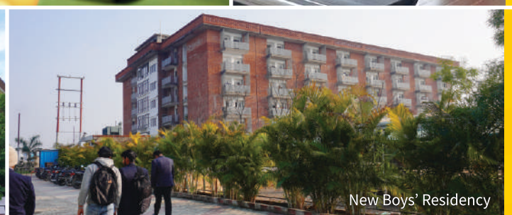
New Boys' Residency